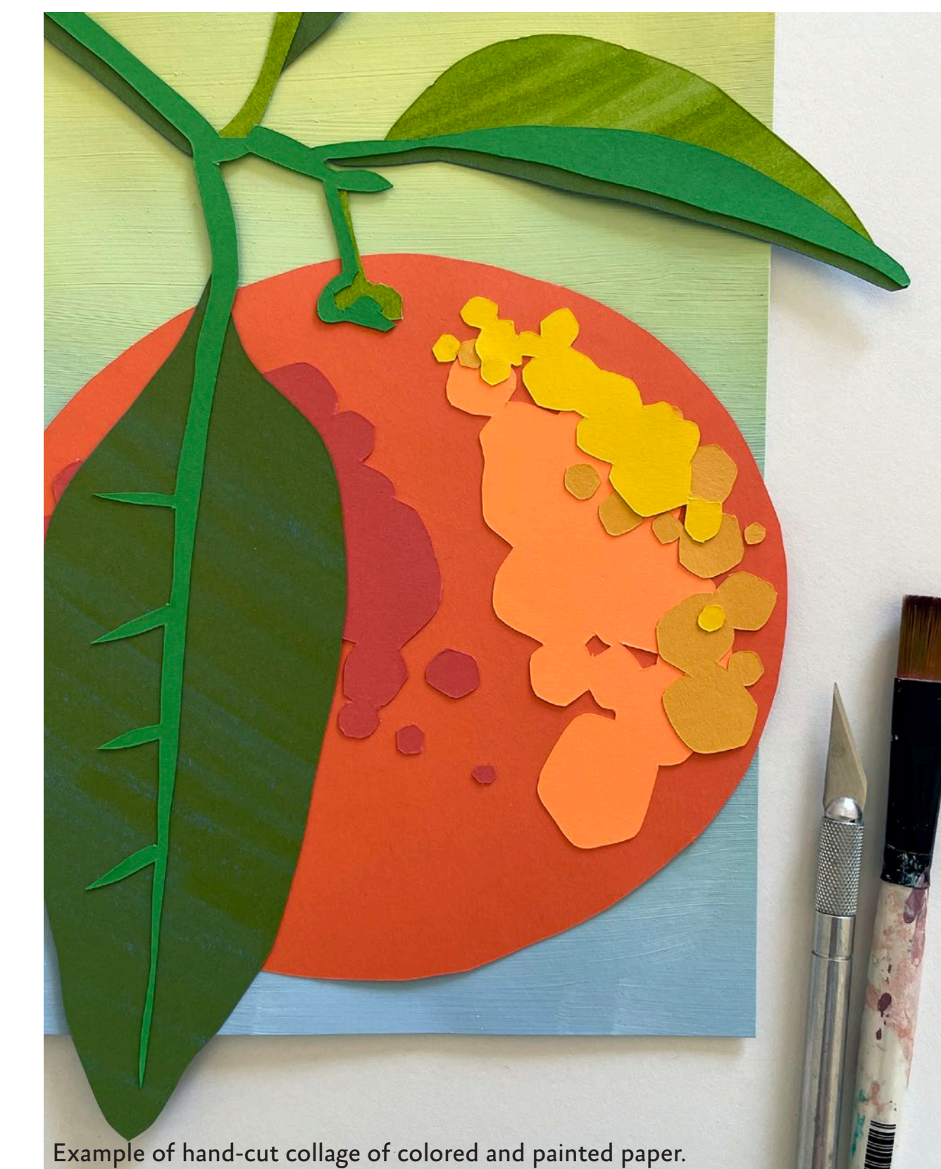
Example of hand-cut collage of colored and painted paper.