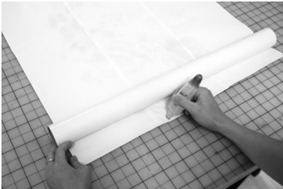
7. Glue fax paper onto mailing tube.

DIFFICULTY MODERATE TIME FAST BUDGET MODERATE