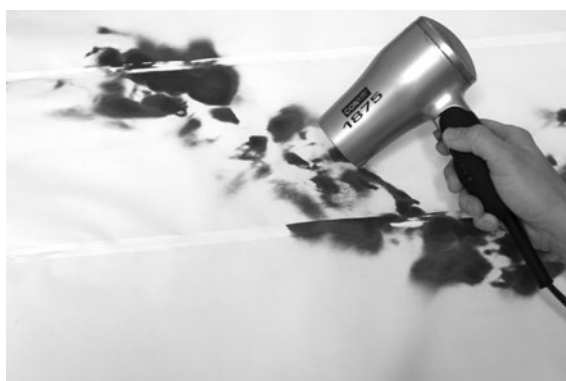
4. Turn on hair dryer and aim at fax paper. Watch bold and fuzzy marks appear.