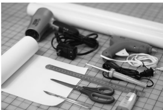
1. These are the materials you will need.