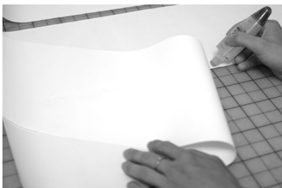
3. Use glue to combine a few sheets of fax paper into one large one.