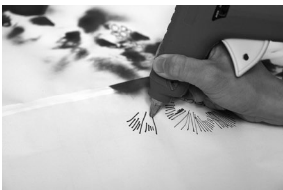
5. Use the heated nozzle of a glue gun for medium lines.