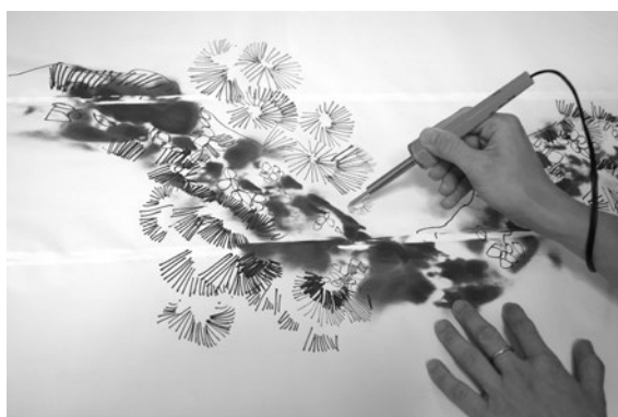
6. Use the heated nozzle of a soldering iron for fine lines. Be careful. Unplug cord if iron get too hot.