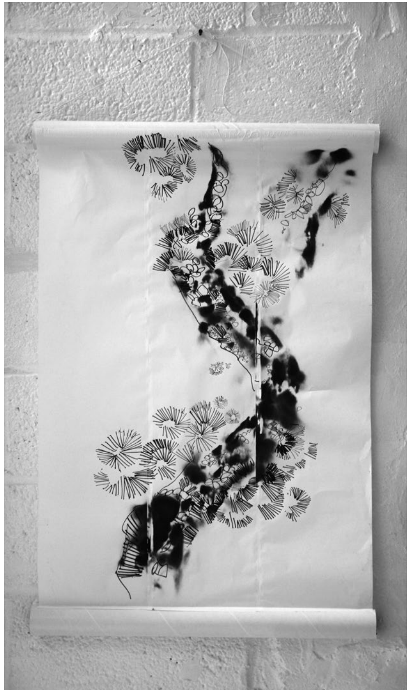
9. Enjoy the wonderful wall hanging.