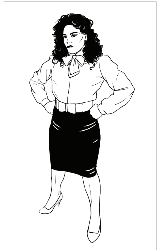
“The Iron Butterfly”