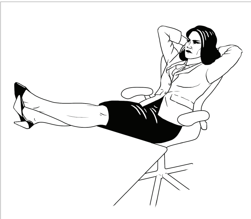
“The Manifest Destiny”

Male/Male-Identified Trainees: Assume the positions on opposite page.